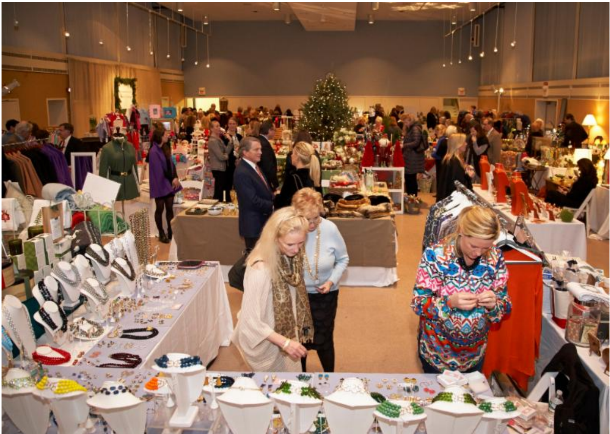
Antiquarius Holiday Boutique