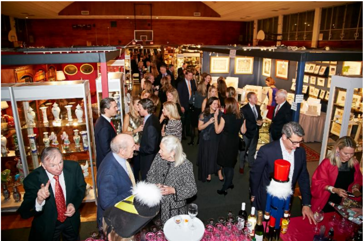
Antiquarius Winter Antiques Show Preview Party