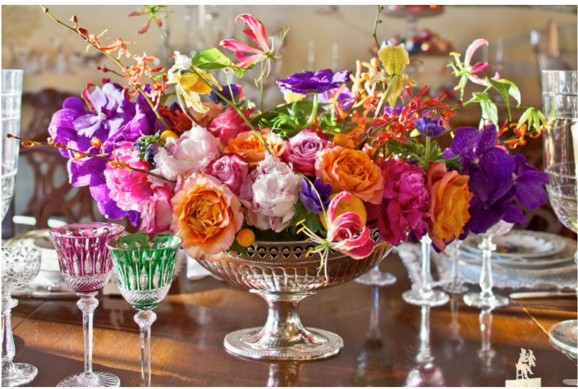
Lovely decor seen on an Antiquarius Holiday House Tour