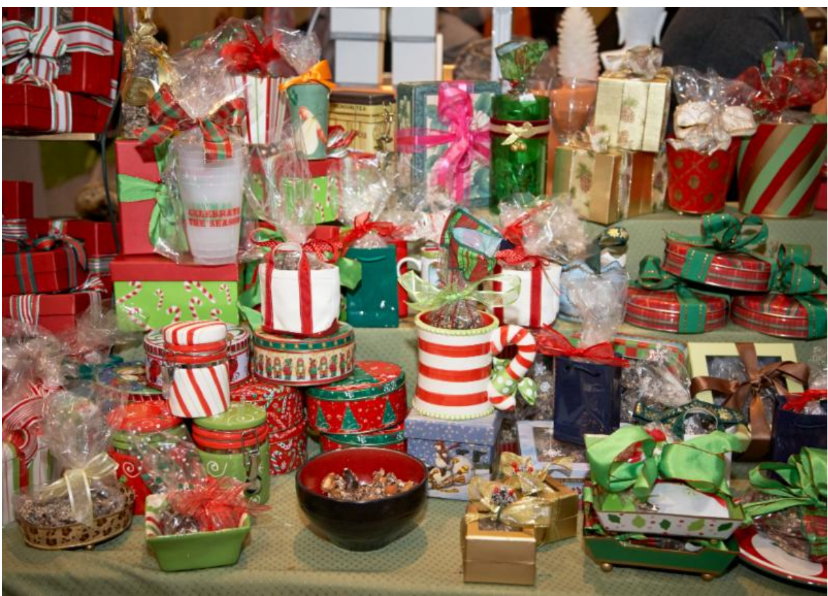
Items at the Antiquarius Holiday Boutique