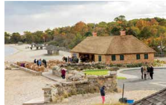
Gateway Garden and Concession Stand, Greenwich Point

Preservation Network, approached the purchaser of the property and convinced him of its historical significance. Not only did the new owner agree to restore the home, but he will also be opening this newly discovered and important piece of Greenwich history to