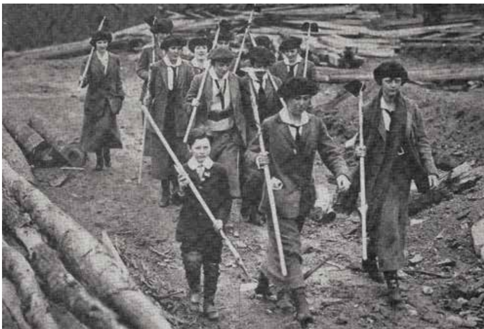
DOING THEIR USEFUL AND SENSIBLE BIT —Instead of organizing themselves as khaki clad, rifle bearing regiments to face batteries of cameras, the girls of Rosemary school of Greenwich, Conn., are daily working to increase the output of the lowly spud. Each girl has a portion of ground sufficient for twenty-five hills, which she will cultivate as long as the potato producing season lasts.

to contribute to food coffers. The goal was to preserve the produce of war gardens and small farms that might otherwise go to waste. Residents brought in produce to be processed for their own use or for consumption by troops or civilians in need. This program operated out of a storefront on Railroad Avenue.