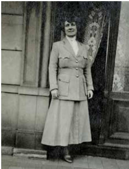
Grace Gallatin Seton, Paris, France, 1919.

The experiences of individual women and girls in Greenwich illustrate the political ramifications of both extraordinary and commonplace activities during World War I. Many women took on jobs traditionally