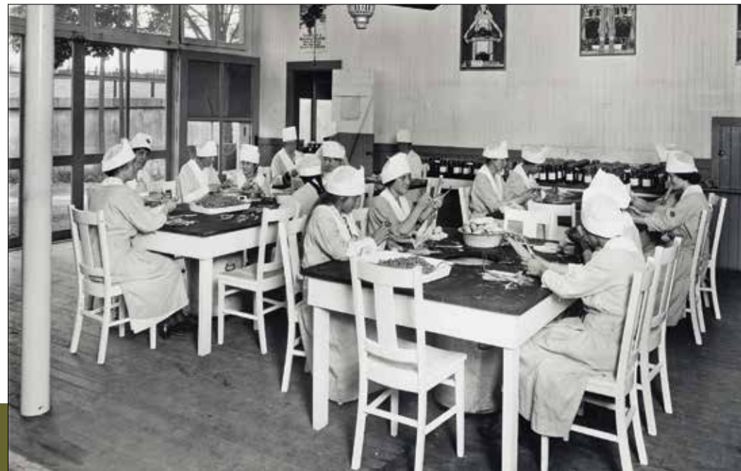
Women and girls working at the Greenwich Canning Kitchen, circa 1918.

break down gender barriers as women assumed the heavy farm labor typically reserved for men. With a training camp in nearby Bedford, New York, the WLA began