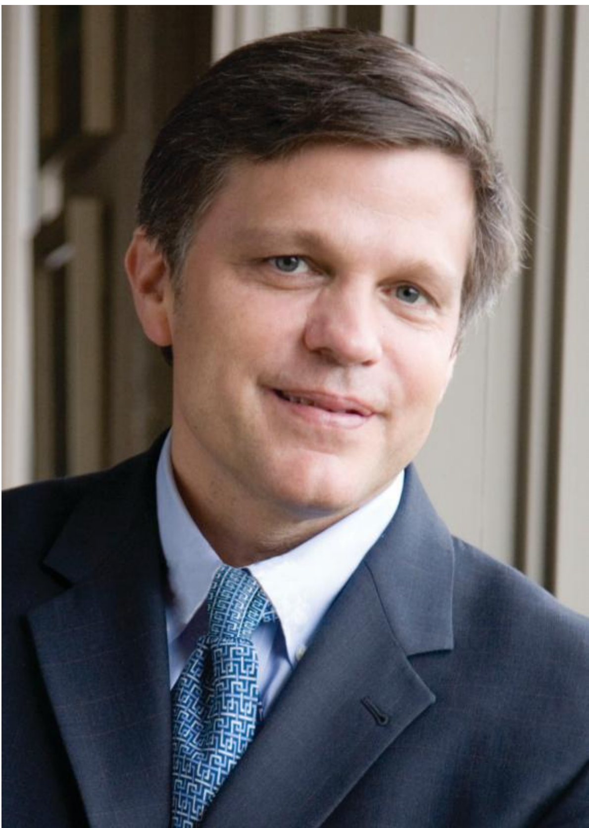
CNN Presidential Historian Douglas Brinkley will speak at a fundraiser for the Greenwich Historical Society on April 18