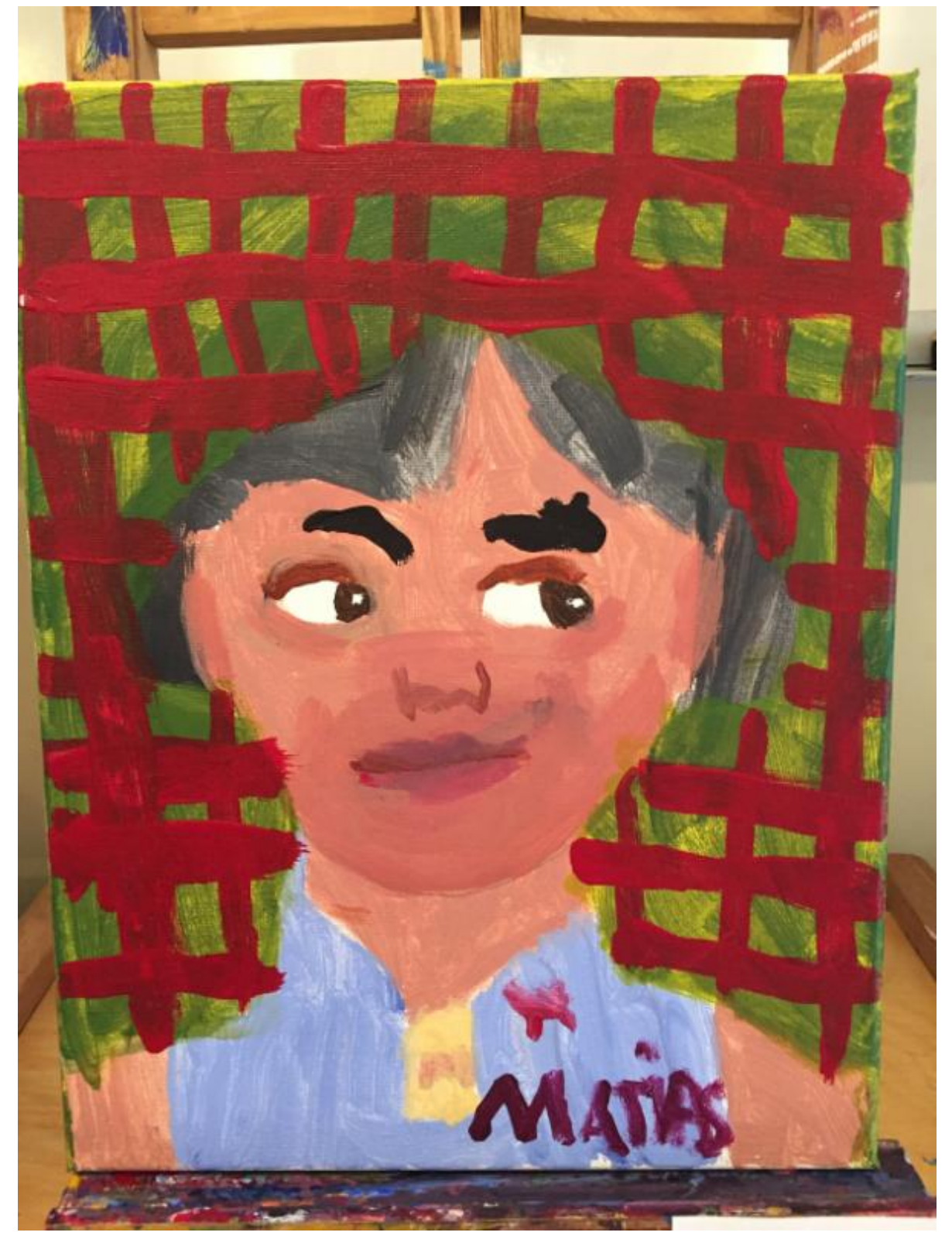
Fourth grade self portrait