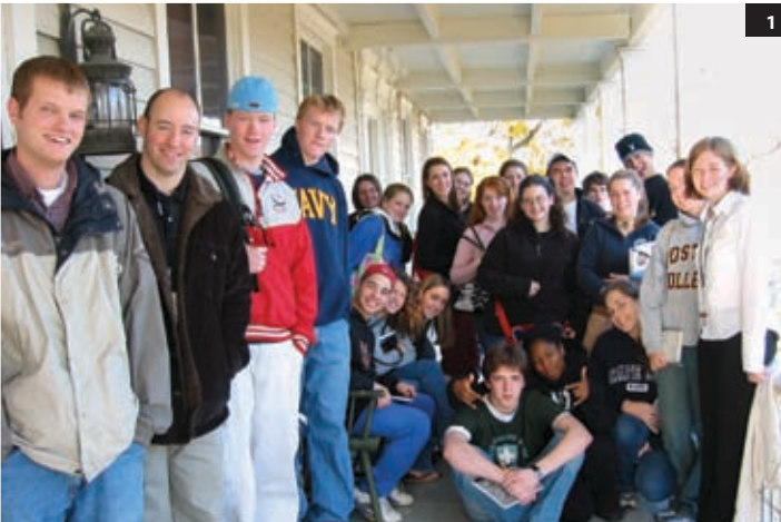
School Visits and Programs 1 Students from New Canaan High School study Bush-Holley House 2 Hamilton Avenue School/Museum Partnership