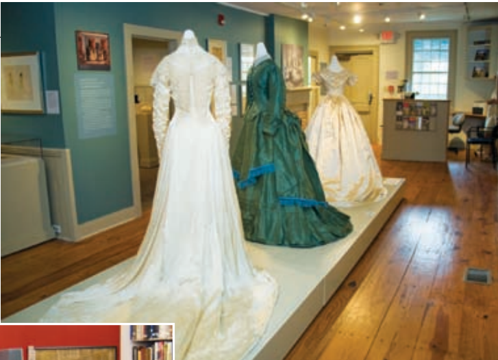
Collection Preservation Wedding dresses from our collection, preserved following a costume and textile inventory project funded by the Connecticut Humanities Council