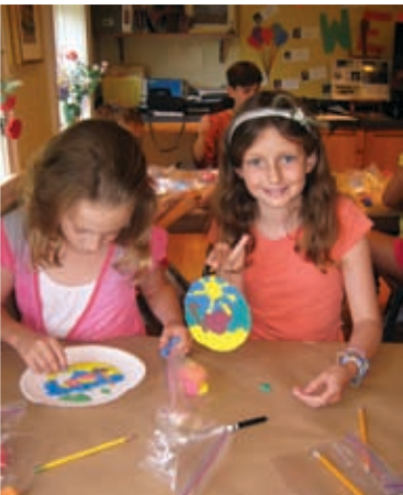
History and Art Camp