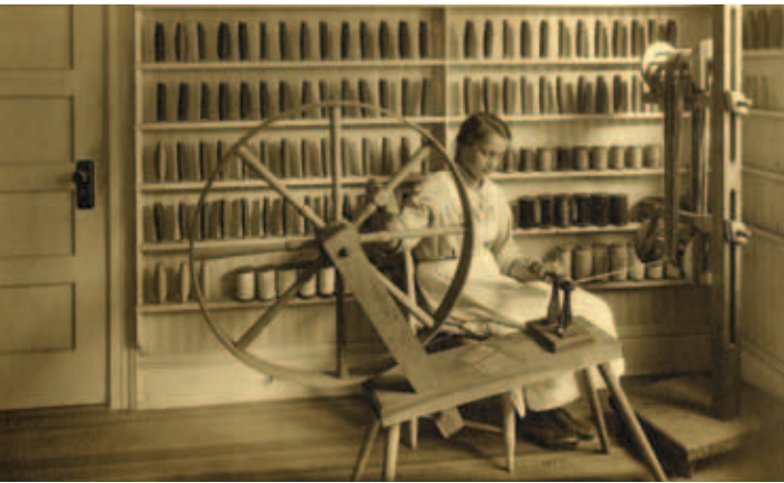
The Weaving House, Bobbin Room, from an article about the Vanderhoef Tapestries that appeared in House Beautiful, December 1916