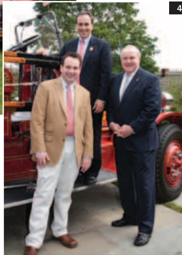
Everyday Heroes: Greenwich First Responders September 14, 2011–August 26, 2012