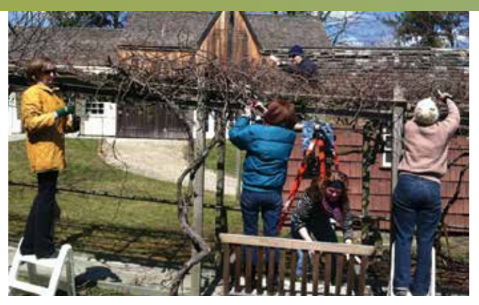
The Green Team wastes no time getting the arbor in shape.

Comedienne Jane Condon entertained the group, wrapping up the evening with a unique and personal take on volunteerism. Over 80 volunteers were in attendance, and all were saluted for the many ways in which they support history, preservation and education in the community.