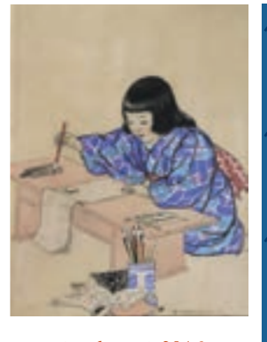
October 12 2016 ~ February 26 2017