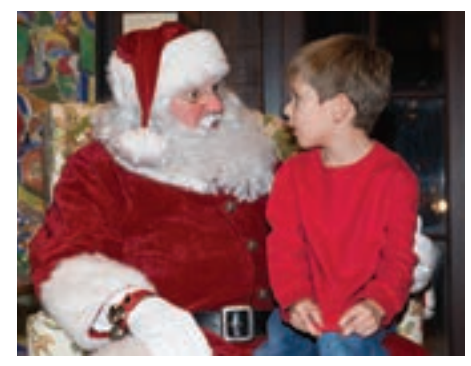
A serious exchange with Santa at last year's Candlelight Event

Sunday, December 11, 2016, 5:00 to 7:00 pm Admission is free to all. No reservations required. Tours begin at the Vanderbilt Education Center.