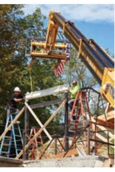
Workers hoist the signed beam

n September 27, 2017, we celebrated a special milestone in our Capital Campaign to reimage our campus. At a topping out ceremony (a centuries-old building tradition), elected officials, town dignitaries, Capital Campaign donors, special guests and supporters gathered to sign a beam before it was hoisted into place. The new campus is expected to be completed in fall 2018 and will include twice the parking, a welcoming lobby with an elevator to the second floor, improved exhibition and archives space, a new museum shop and a self-service cafe.