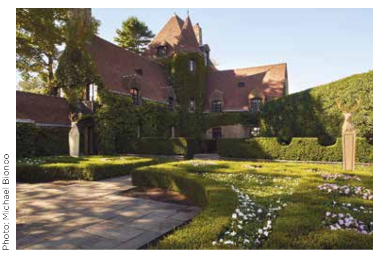
Landmarked Property Chateau Paterno, 1939