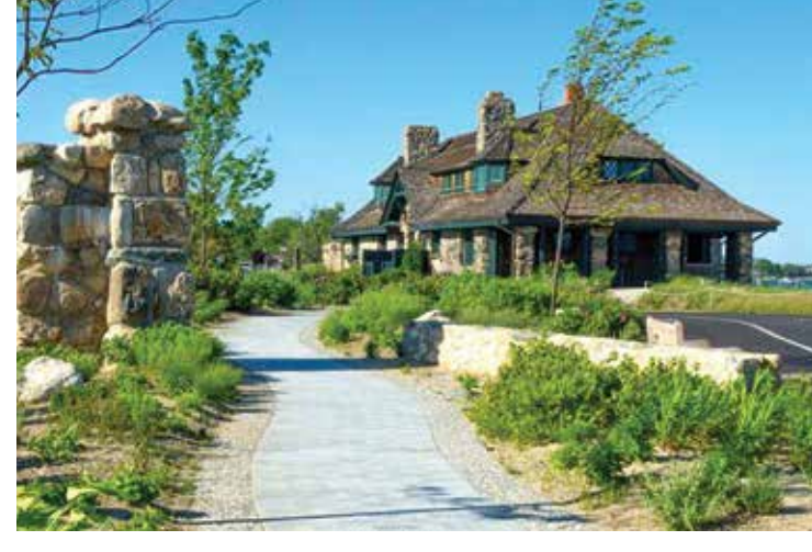
Preservation Award winner Greenwich Point Conservancy restored Innis Arden Cottage. The Gateway Garden was a gift of Green Fingers Garden Club.