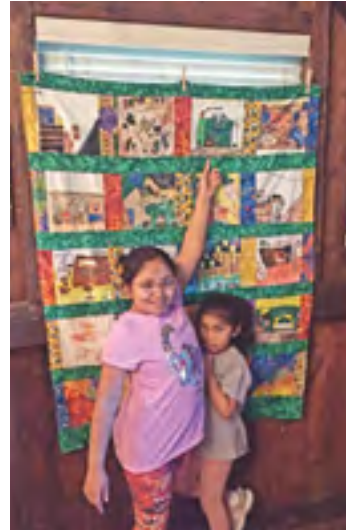
A Hamilton Avenue student proudly points out her quilt panel.

In the 2018-2019 school year, Greenwich Historical Society educators led 280 Hamilton Avenue School students in grades 1 to 5 in unique grade-specific programs designed to supplement social studies and art curricula standards.