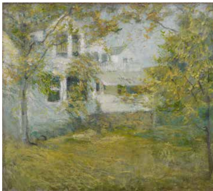
John Henry Twachtman, September Sunshine , ca. 1892–94. Oil on canvas. Crystal Bridges Museum of American Art

We continued to offer both virtual and live programs to accommodate teachers and schools, upholding our commitment to education as a key pillar of our mission, assuring every third grader in Greenwich public schools — and most private schools — explored American history through our Sarah Bush and Her Town program.