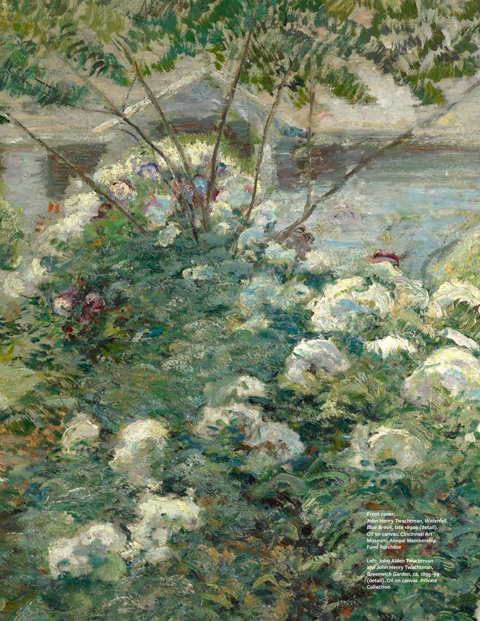
Front cover: John Henry Twachtman, Waterfall, Blue Brook , late 1890s (detail). Oil on canvas. Cincinnati Art Museum, Annual Membership Fund Purchase