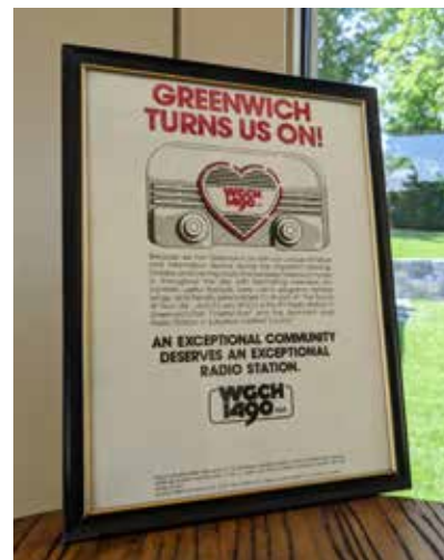
Framed ad for WGCH 1490 AM from 1960s "Greenwich Turns Us On!"