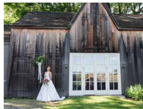
Historic Barn / Vanderbilt Education Center