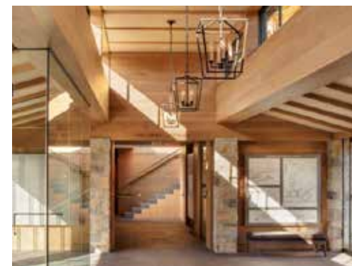
Museum Lobby & Courtyard

The Greenwich Historical Society offers an array of unique setting options for your next event – whether an intimate gathering or large celebration. Tented on the Great Lawn or in our historic barn, in our elegant lobby, gardens or galleries, or rent the entire site – the perfect venue for corporate meetings, retreats, bridal showers, birthday parties, engagements, anniversary parties and weddings.