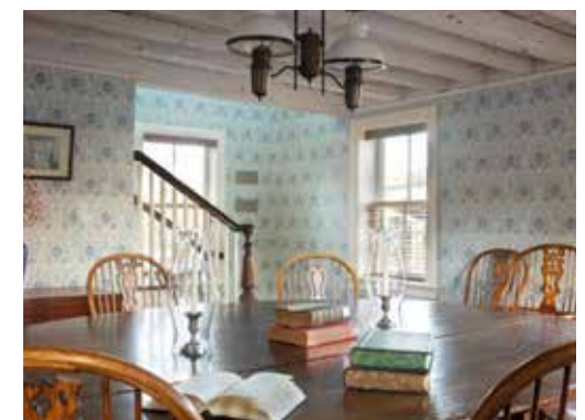
Getz Conference Room