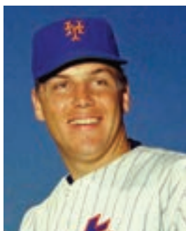
Tom Seaver (1944–2020)

Major League Baseball pitcher Tom Seaver (1944–2020), who was inducted into the Baseball Hall of Fame in 1992 for his illustrious career largely spent with the New York Mets, was a native of California but selected Greenwich as home for his young family in 1970. Although Seaver and his wife returned to his home state following their daughter's graduation from Greenwich High School in the late