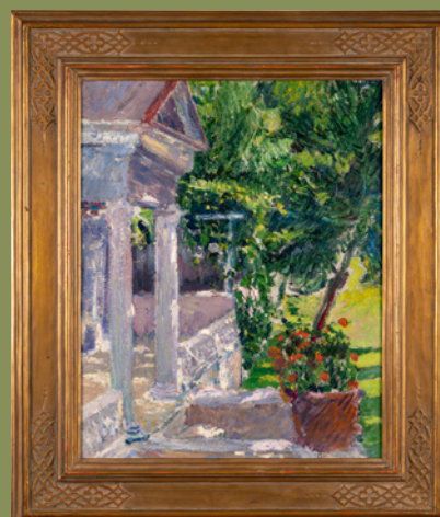
John Henry Twachtman (1853-1902) Front Porch, ca. 1896-99 Oil on canvas. 20 x 16 inches

The painting will be on public view to visitors in the Greenwich Historical Society's Permanent Collections Gallery beginning in Spring 2024.