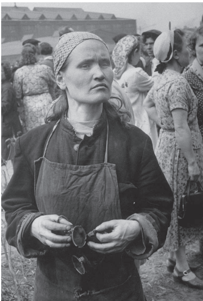
unpublished photograph from "Tito as Soviet Hero, How Times Have Changed!" LIFE, June 25, 1956