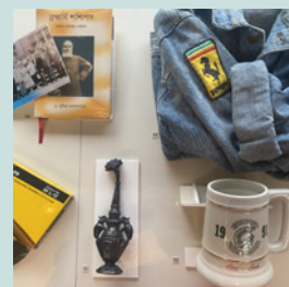
2023 exhibit detail

Greenwich Historical Society presents the second annual student-curated exhibit highlighting personal family stories and artifacts gathered as part of the My Story, Our Future project. A collaborative initiative organized by the India Cultural Center and