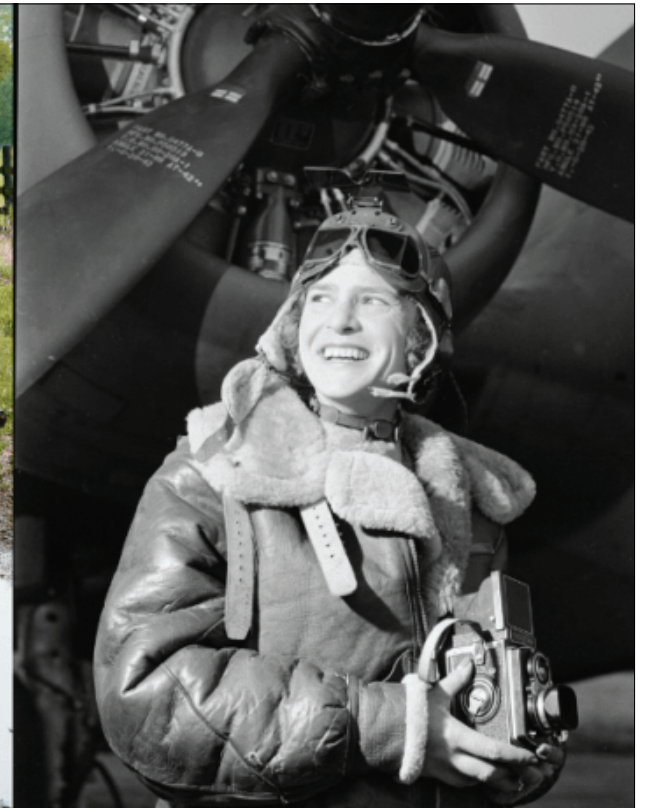
Connecticut Women's Hall of Fame Inductees Annie Leibovitz (left) and Margaret Bourke-White (right).