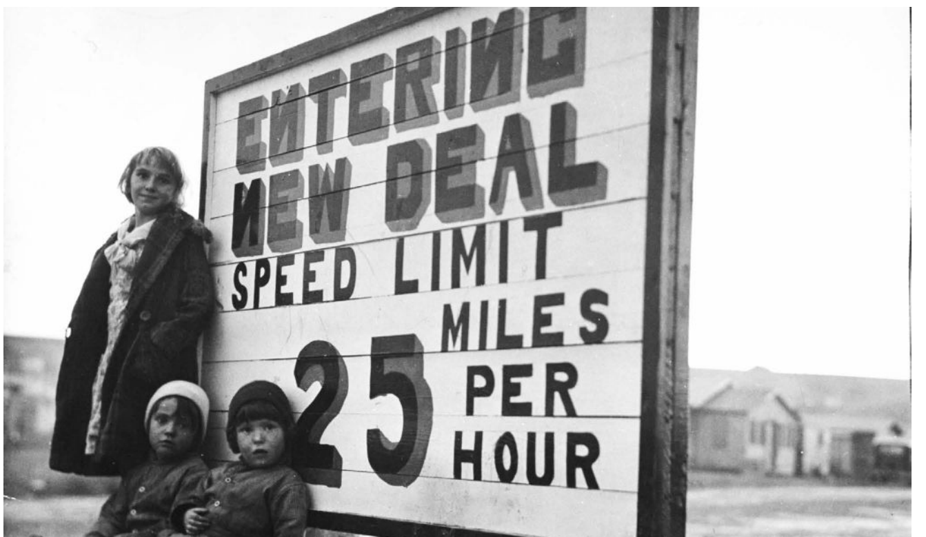
Margaret Bourke-White, photograph from "Franklin Roosevelt's Wild West," LIFE, November 23, 1936 Margaret Bourke-White became one of the first four staff photographers at LIFE in 1936.