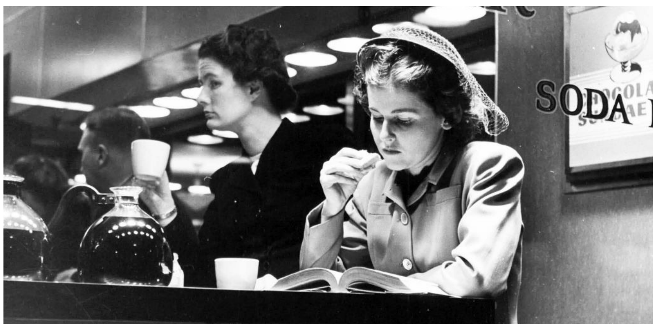
Nina Leen, unpublished photograph from "American Woman's Dilemma," LIFE, June 16, 1947 © LIFE Picture Collection, Dotdash Meredith Corp. Leen also photographed single working women for "American Woman's Dilemma," but most of those photographs, such as this one, were not printed in the magazine.