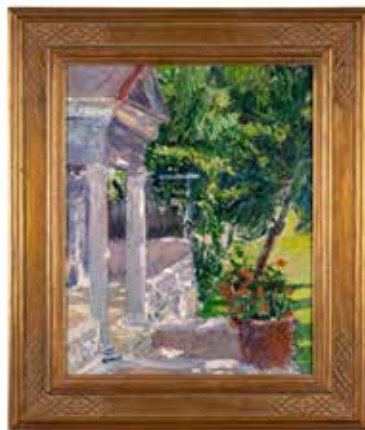
John Henry Twachtman (1853–1902) Front Porch , ca. 1896–99 Oil on canvas

John Henry Twachtman (1853–1902), Front Porch , ca. 1896–99 Oil on canvas 2023.06