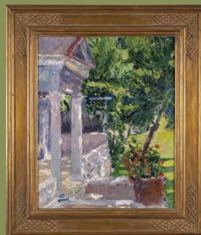
John Henry Twachtman (1853-1902) Front Porch , ca. 1896-99 Oil on canvas. 20 x 16 inches

The painting will be on public view to visitors in the Greenwich Historical Society's Permanent Collections Gallery beginning in Spring 2024.