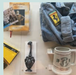
2023 exhibit detail

Greenwich Historical Society presents the second annual student-curated exhibit highlighting personal family stories and artifacts gathered as part of the My Story, Our Future project. A collaborative initiative organized by the India Cultural Center and